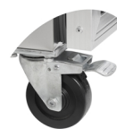
Strong castors as option