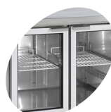
Aluminium door frames and LED light