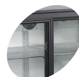
Door holder for loading of the cabinet