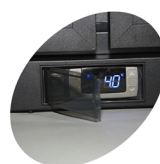
Protective thermostat cover