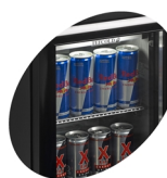
Designed for Energy-cans