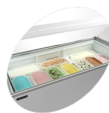
Scooping basket option