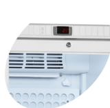
Thermostat with audible and external alarm