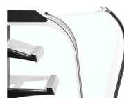
Frame hinges forward for easy cleaning